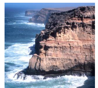
The Zuytdorp Cliffs

One of the most recent major geological events in Shark Bay was the formation of the Zuytdorp Cliffs. Geologists believe the cliffs were formed when the Earth's crust shifted along a fault-line some 5 000 years ago. More than 200 km in length, the Zuytdorp Cliffs probably constitute the longest fault scarp in Australia.